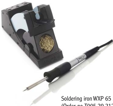
Soldering iron WXP 65 Set (Order-no.T005 29 212 99)