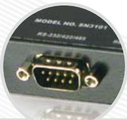
RS-232/422/485 3-in-1 serial Port