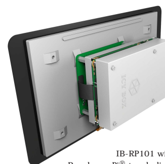
IB-RP101 with a Raspberry Pi® touch display

Packing content : IB-RP101, 3 sets of screws, heatsink, foot pads, QIG