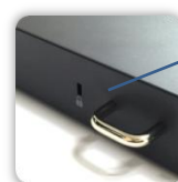
Kensington Lock &amp; U-bar Lock