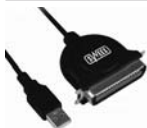
CD004 Sweex USB to Parallel Cable