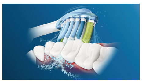
Philips Sonicare's advanced sonic technology pulses water between your teeth, and its brush strokes break plaque up and sweep it away for an exceptional daily clean.