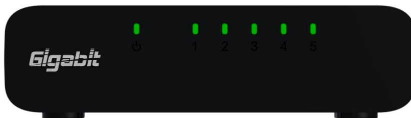
5-Port Gigabit Desktop Switch

Please refer to the following description for the front panel: