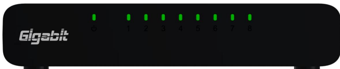
8-Port Gigabit Desktop Switch