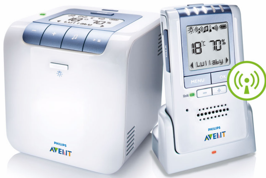
Philips AVENT DECT baby monitor