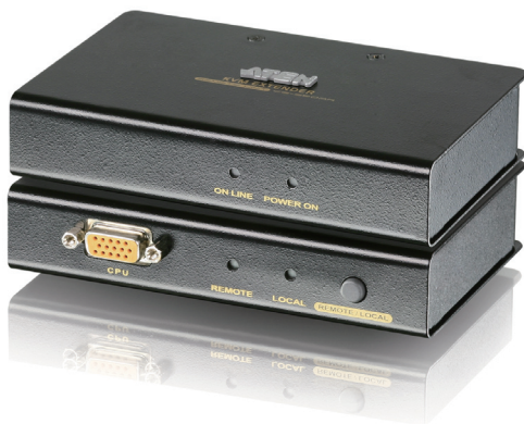
CE250AR (Remote unit)