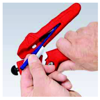
The assembly tool comes with three torpedo capsules for the various cable cross-sections